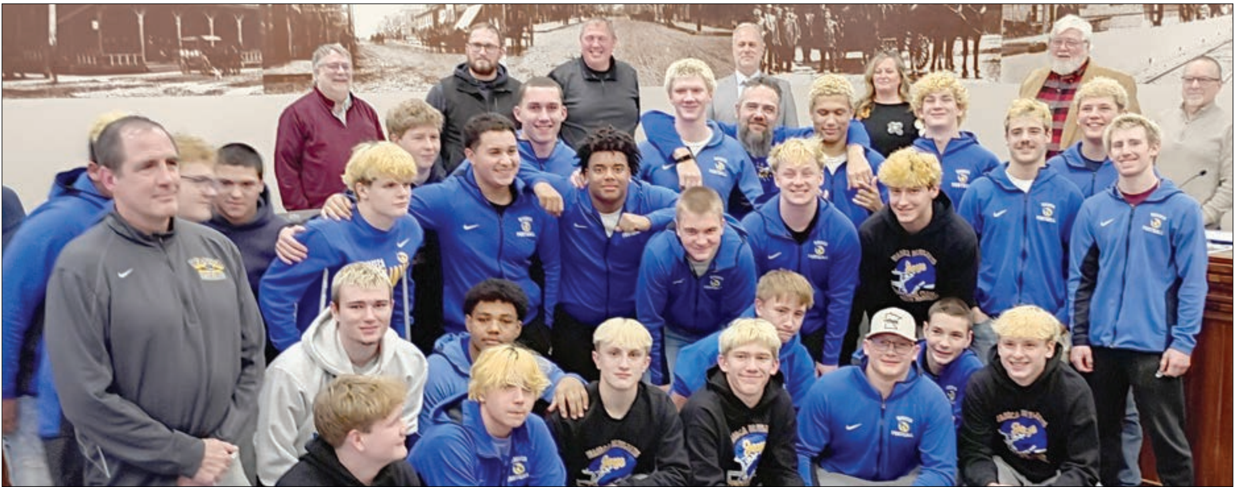
PROCLAMATION - There was a mayoral proclamation made on behalf of the Blue Jay 2025 football team placing second in the State Championship game at the Waseca city council meeting on Tuesday, Jan. 6, 2025.