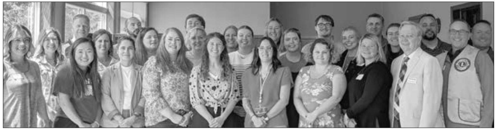
There were 17 new teaching staff members from four Waseca learning sites introduced and welcomed at a luncheon co-sponsored by the Waseca Rotary, Lions, and Exchange clubs on Thursday, Aug. 21, at the Lakeview Golf Course.

Today is the day to humble ourselves in obedience before God's good and right way. Today is the day you and your loved ones need to take your faith seriously. It is more than a life and death issue - it is an eternal life and eternal death issue. It is more than worth dying for - it is worth living for.