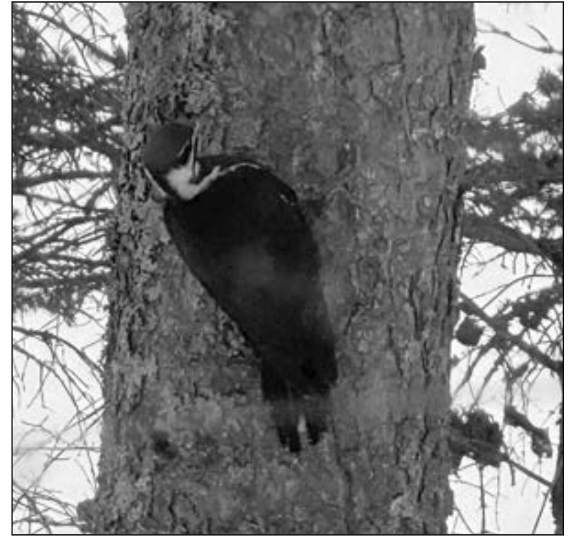
Pictured is a pileated woodpecker spotted through the window at my family's cabin.

When he again stated payment was unnecessary, I told him we