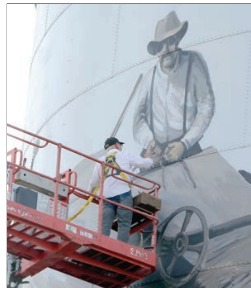
MAKING PROGRESS - The mural, which began on Sept. 10, is more than half finished.

In honor of the site's history, the mural depicts a wheat harvest in process, as it would have looked in the late 1800s. Four horses draw a reaper through a golden field while the machine behind them cuts the plants and